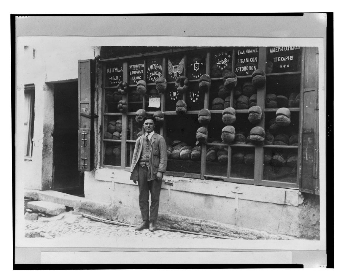
Fig. 11.2 Baker standing in front of the "American Bakery" that displays signs in Armenian, Ladino (in Hebrew characters), English, Ottoman Turkish, Greek, and Russian with samples of bread attached to the mullions, Ortaköy, Istanbul, Turkey, 1922.

world" (Hanioğlu, 2008, p. 35). There was also a wide gap between the learned and popular registers of Ottoman Turkish, to the degree that it has been considered in retrospect to have constituted a case of diglossia (Strauss, 1995b, p. 233). When we consider that besides Turkish, Arabic, and Persian, the empire's important languages included Greek, Armenian, Albanian, Kurdish, Bulgarian, and Serbian, we can see that the linguistic scene was very rich indeed. In different parts of the empire, certain individual languages were dominant, for example, Arabic in, say, Baghdad, Turkish in the urban areas of central Anatolia, or Greek in several of the coastal cities, such as Izmir/Smyrna (Strauss, 2011, p. 129). In the numerous areas with a high degree of ethnic mixing, numerous tongues were seen (Fig. 11.2) or heard.