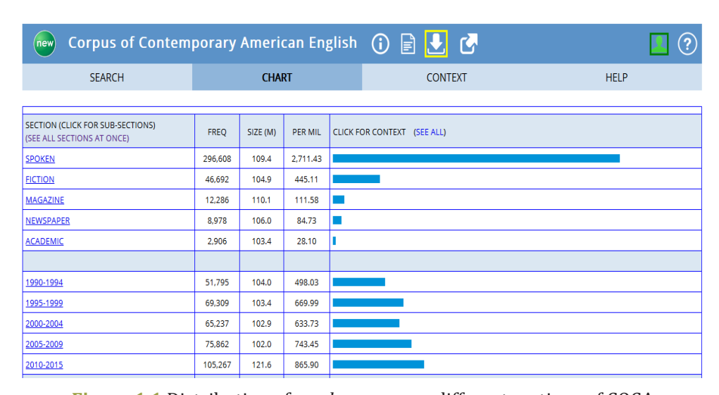
Figure 1.1 Distribution of you know across different sections of COCA.

A screenshot of a search output page from COCA (Figure 1.1) contains frequencies of the phrase you know in American English.